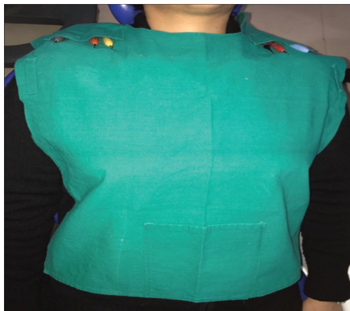
[Table/Fig-1b]: Drape further extends onto the patients shoulder by means of shoulder straps.